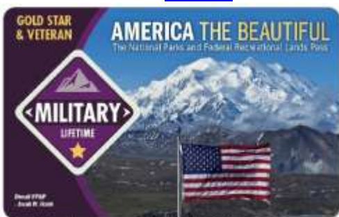
New life time pass available for Military Veterans

More information is available at the National Parks Service website .