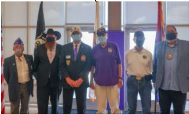
Cdr Gray Congratulates PH Recipients.