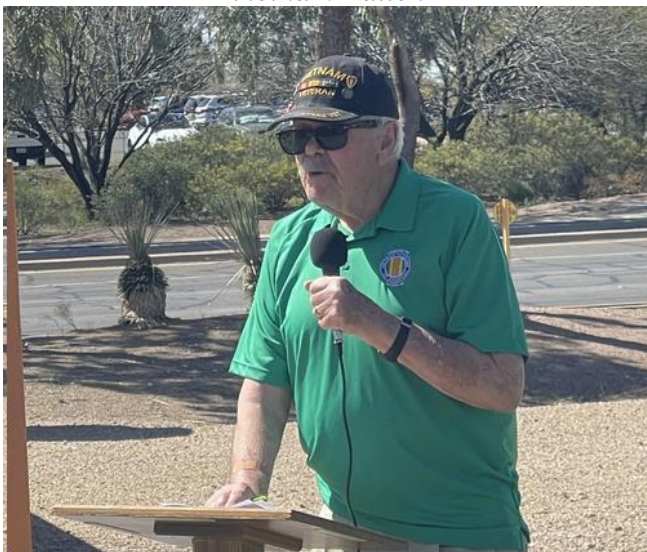
Plaque with the names of the 107 Tucson Fallen dedicated on March 29 th .