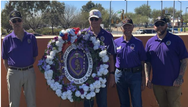
Patriots from Chapter 442 at National Vietnam War Veterans Day.